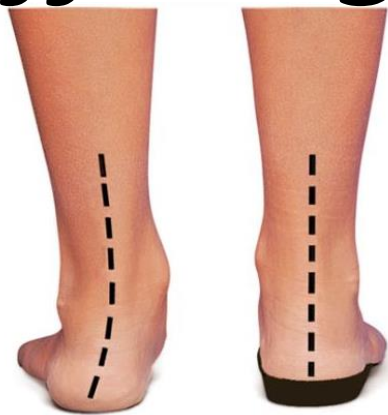
Before | After